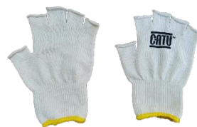
Cotton mittens CG-81