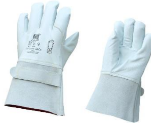
Over-gloves CG-991 For class 1 to 4