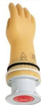
Pneumatic gloves tester CG-117