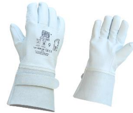
Over-gloves CG-981 for class 00 or 0