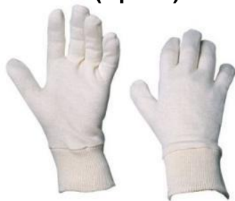
Cotton under-gloves CG-80